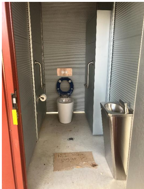
The interior of the new units