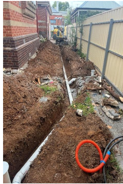
The plumbing to the new toilet block is in place