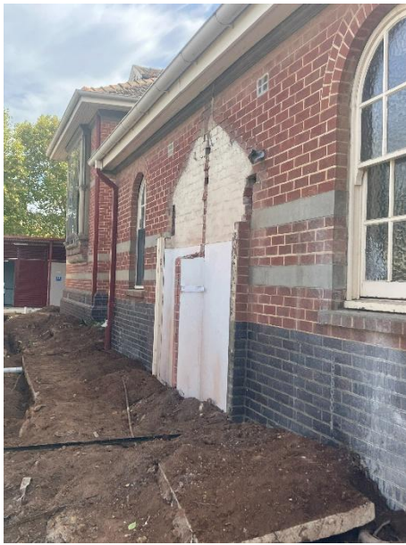
The old toilet block has been demolished