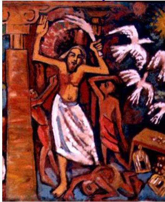
- Jesus cleanses the Temple