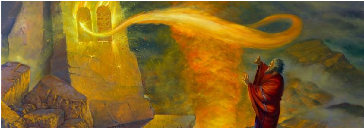
Giving of the 10 Commandments

Sunday 8.00am and 9.30am Wednesday 10.00am