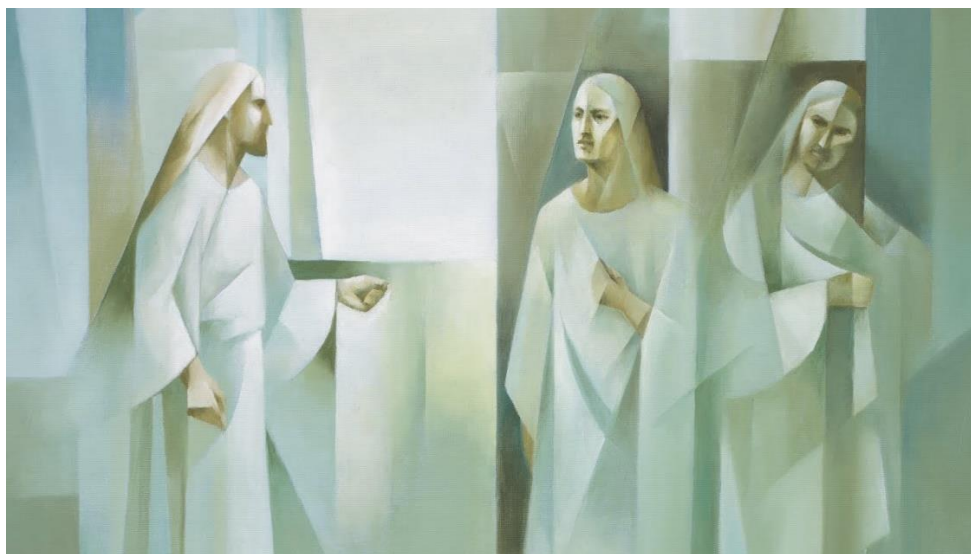
The parable of the two sons - Jorge Santángelo

Sunday 8.00am and 9.30am Wednesday 10.00am