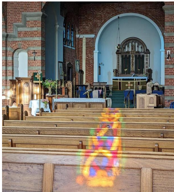
All Souls' afternoon light

Sunday 8.00am and 9.30am Wednesday 10.00am