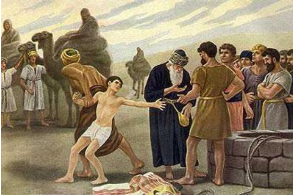
Joseph sold by his brothers

Sunday 8.00am and 9.30am Wednesday 10.00am