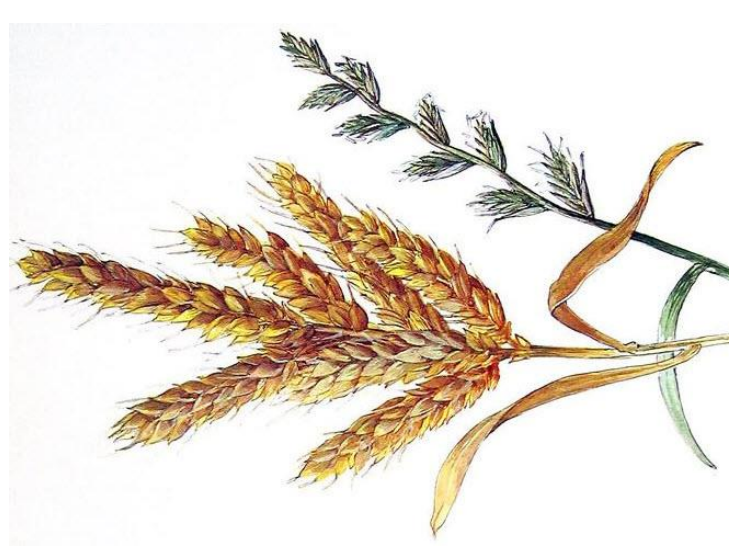
The Parable of the Wheat and the Tares