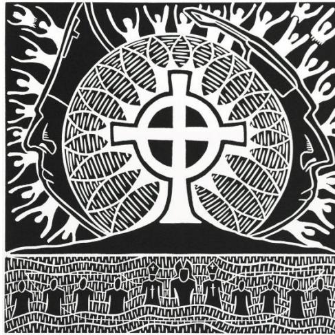
Coming of the Light, G.K. Thaiday, Short St Gallery

Sunday 8.00am and 9.30am Brass Ensemble today @ 9.30am Wednesday 10.00am