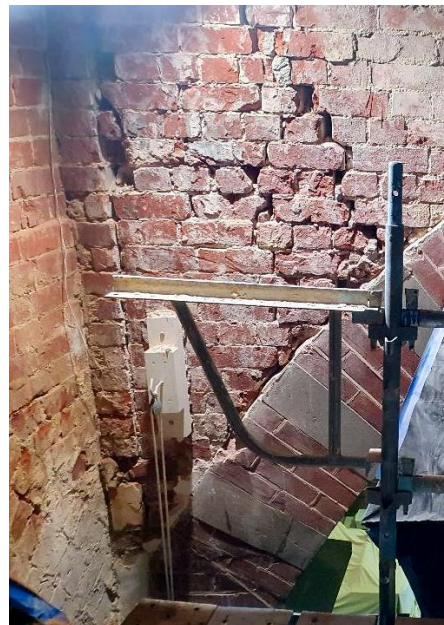
Above left: Up close with the south-west Chancel windows. Right: Earthquake damage in the south-east corner by the apse.