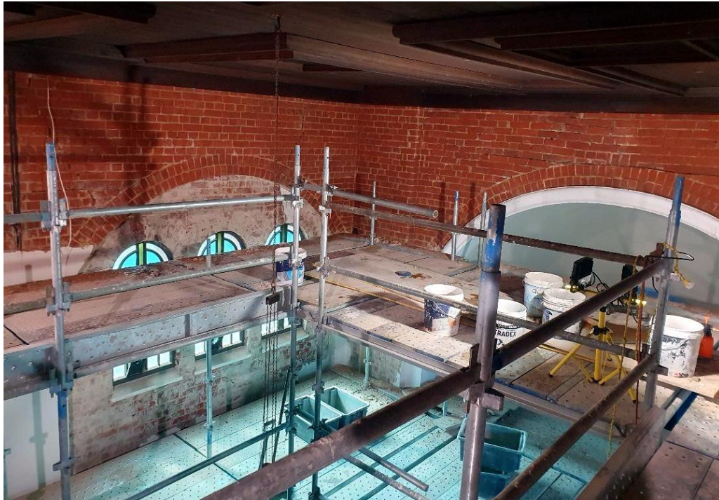
The view of the south-east Chancel corner from the top of the scaffolding.