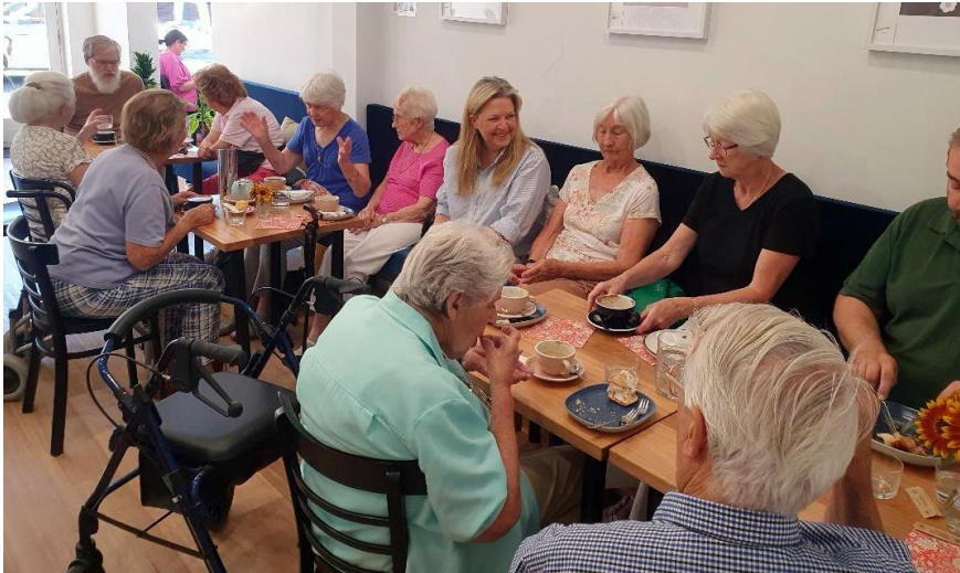
Left: Coffee Club gathering at Nathaniel's on Payneham Road. Below: Sanctuary Guild meeting in the church.