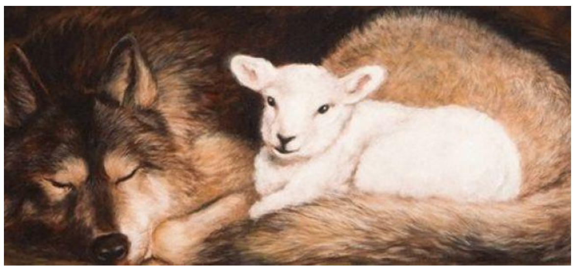
The wolf and the lamb shall feed together – Isaiah 65: 24