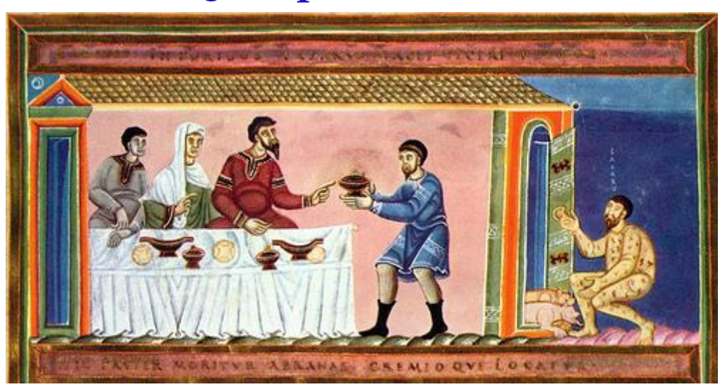
The Rich Man and Lazarus