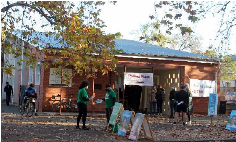
All Souls' Election Day The Sausage Sizzle and Plant Sale raised close to $1 600, while many people enjoyed a hot drink while viewing the windows in the church