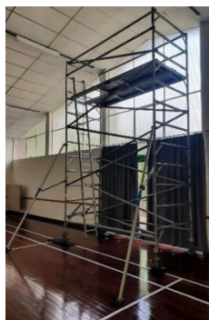
Scaffolding erected in Coles Hall ready for the installation of more blinds