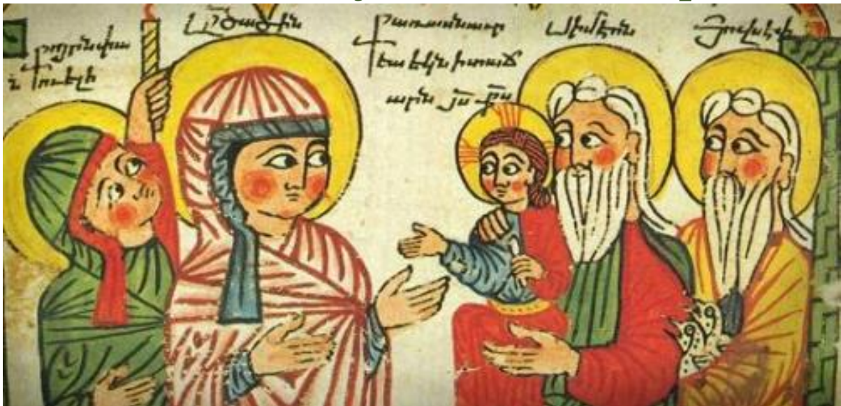
Armenian icon