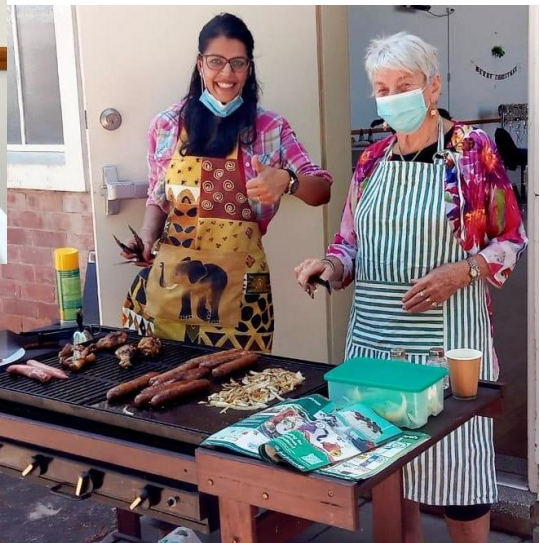
The Boxing Day Parish Party