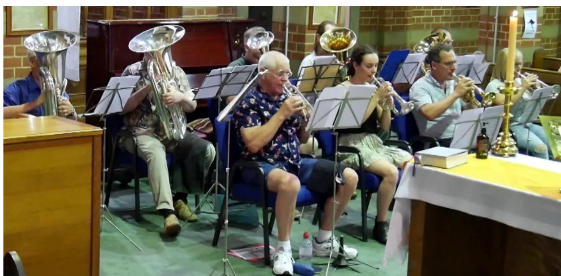
The Brass Ensemble playing on Christmas Eve.