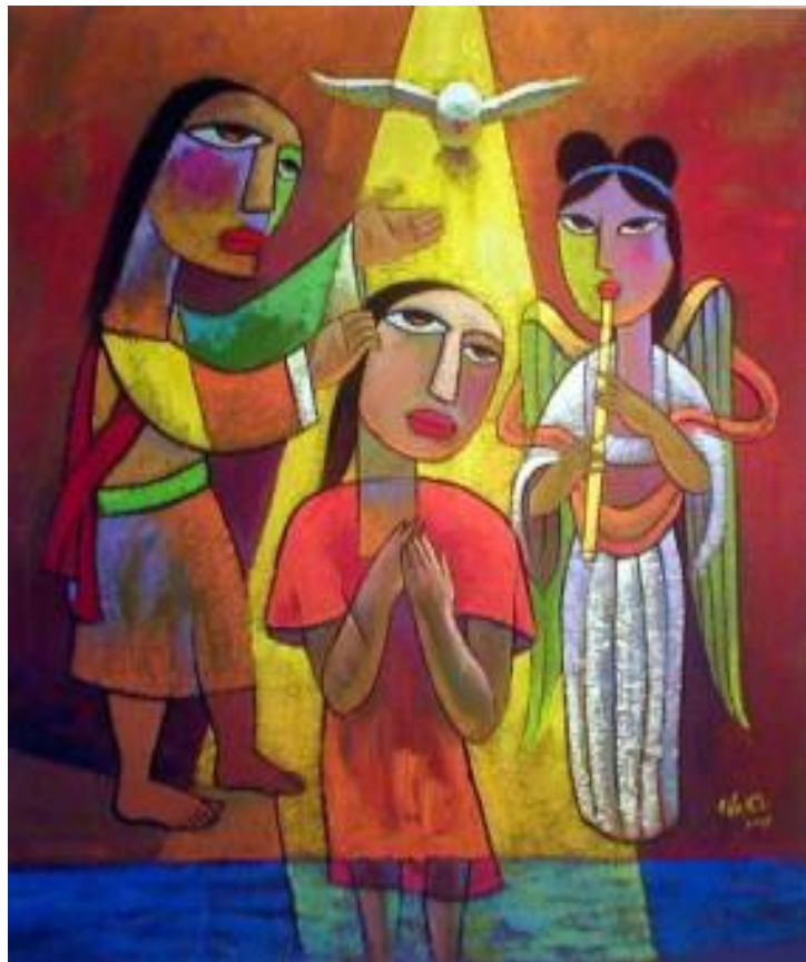
Baptism of Christ – He Qi