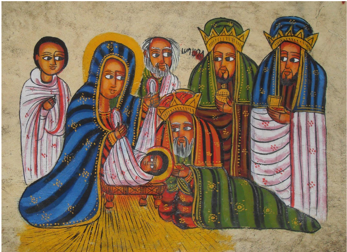
- Ethiopian icon

Sunday Services 8.00am and 9.30am Wednesday 10.00am