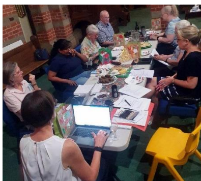
Council December meeting and Christmas celebration.