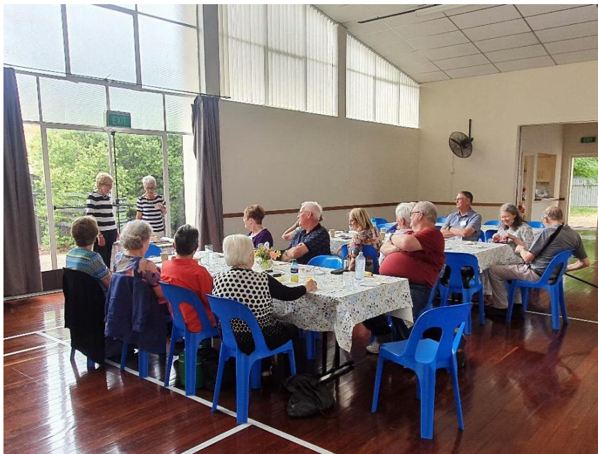
Spicer Community Lunch in Coles Hall before viewing the windows in the church. Note the two sets of new blinds on the windows in the background.