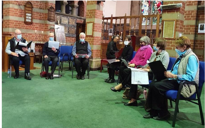
Images from the Service of quiet: Casting stones in confession and the choir.