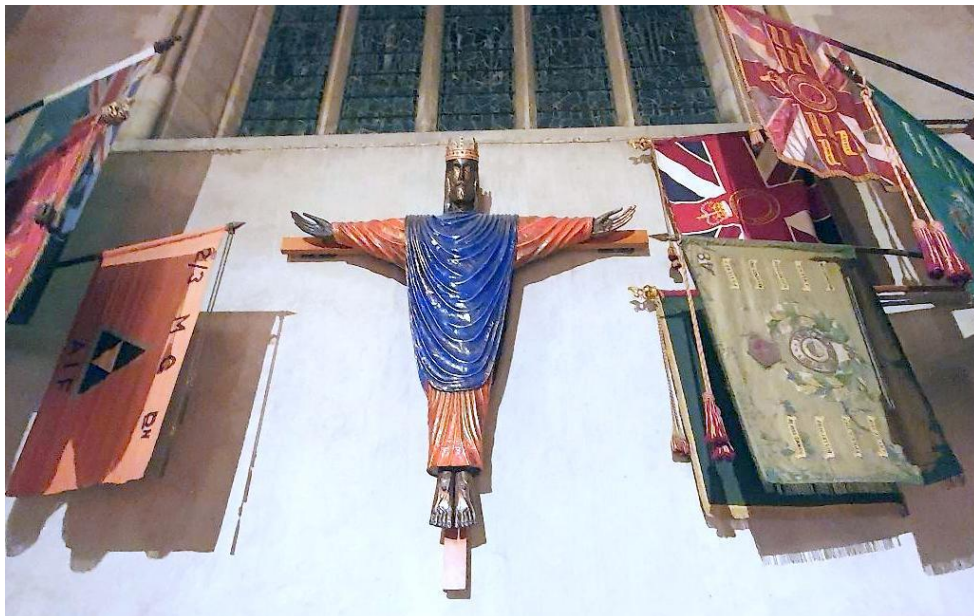
St Peter's Cathedral, North Adelaide

Sunday Services 8.00am and 9.30am Wednesday 10.00am