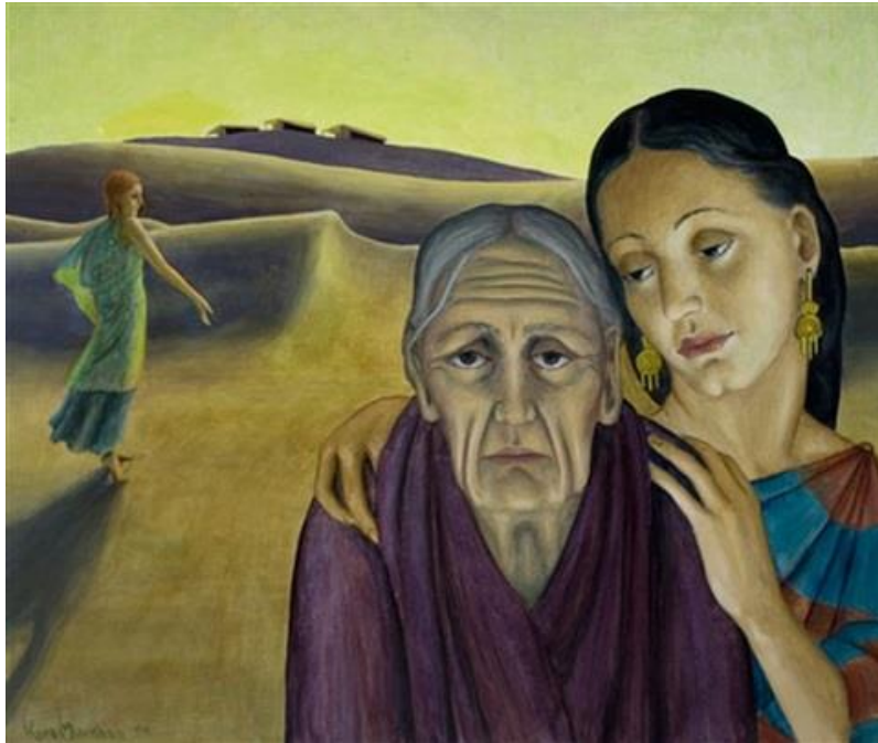
Orpah, Naomi and Ruth