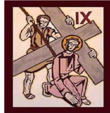
Jesus falls a third time.