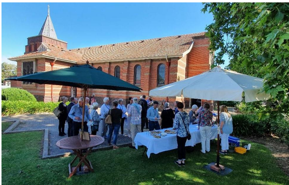
The very successful windows reception: Pre-viewing drinks and snacks

Patronal Festival 2021 A service of celebration and dedication Celebrating parish ministries and re-dedicating ourselves to “community and connection” 9.00am, Sunday 7 November, followed by tea in Coles Hall SIGN-UP SHEET FOR EATS AT THE BACK OF THE CHURCH