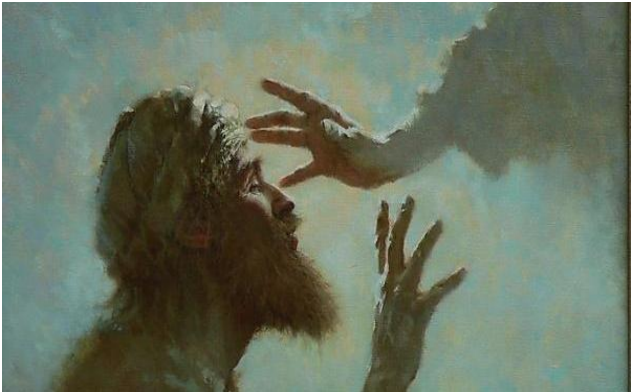
The healing of Bartimaeus

Sunday Services 8.00am and 9.30am Wednesday 10.00am