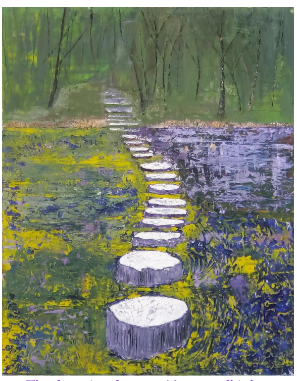
The Stepping Stones - Norman Shipley