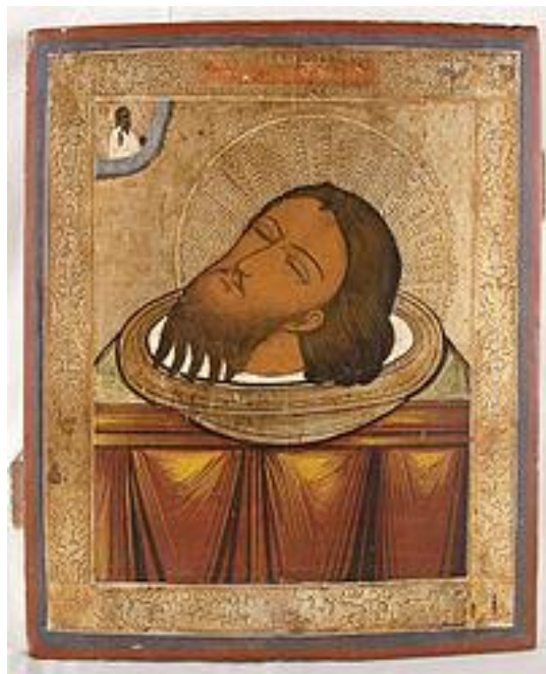
Icon of the death of John the Baptist

Sunday Services 8.00am and 9.30am Wednesday morning service 10.00am