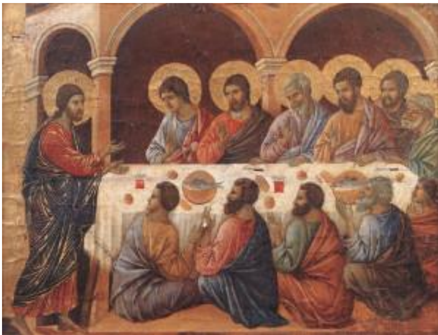
Jesus appears while the Apostles are at table – Duccio di Buoninsegna

Services Sunday 8.00am and 9.30am Wednesday 10.00am