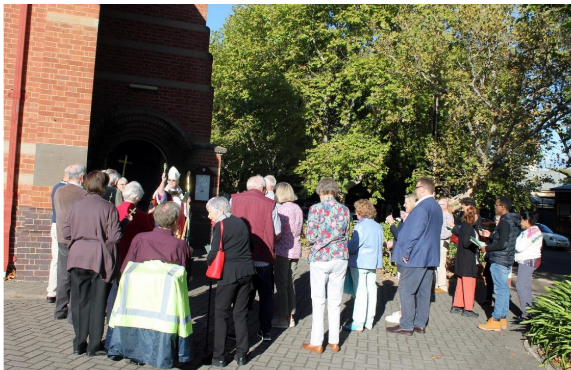
Bishop Denise blessing the Palm Crosses.

A/c Name: Parish of All Souls St Peters BankSA BSB: 105-169 A/c No: 759245140