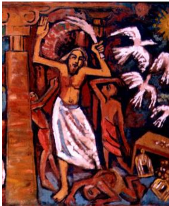
- Jesus cleanses the Temple

Services Sunday 8.00am and 9.30am Wednesday 10.00am