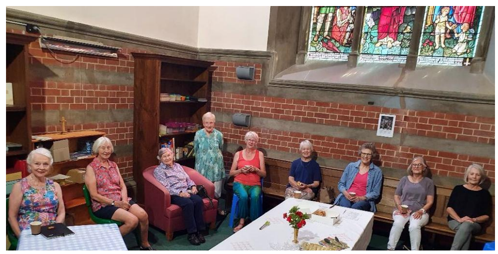
Sanctuary Guild meeting and tea Saturday 24 January