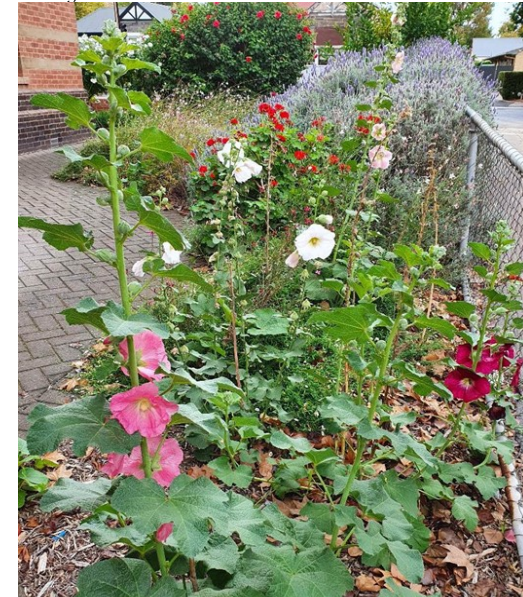
Four shades of hollyhocks, lavender, geraniums and lemons in the church lockdown garden. Marmalade-makers, please help yourselves!

Churches are not being closed. Buildings have been closed. We are the church! We remain.